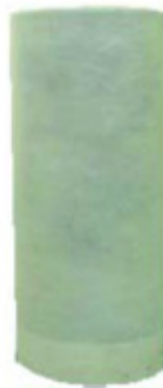
OPM220-M1, OPM 110-M1